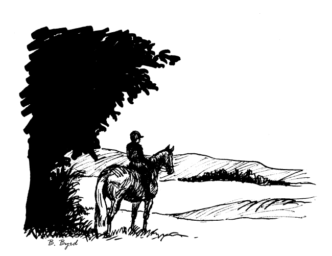
Welcome Horses & Riders