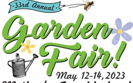
Mother's Day Weekend

Save the Date for next year's Garden Fair on Mother's Day weekend! We heard you loud and clear and we'll be back at Blandy for the 33rd Annual Garden Fair, May 12-14, 2023. We're looking forward to seeing you!