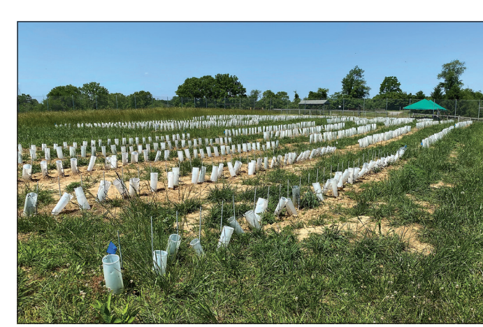
Cross-breeding American and Chinese chestnut trees is another research focus of the facility.