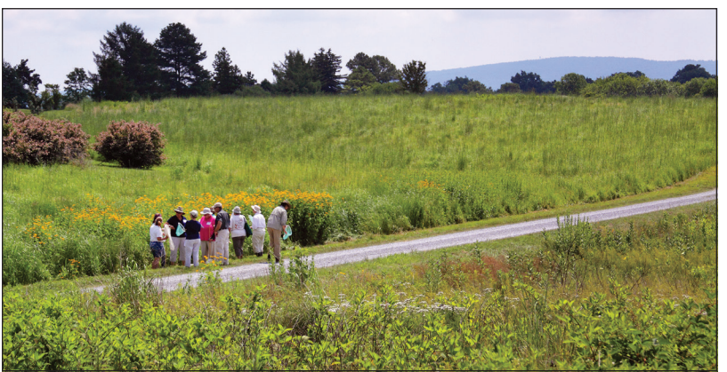
The facility offers many workshops, such as this one on pollinators.