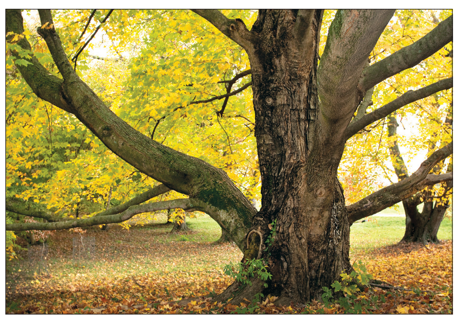
There are 28 state champion trees at the site. This champion is a Blandy maple.