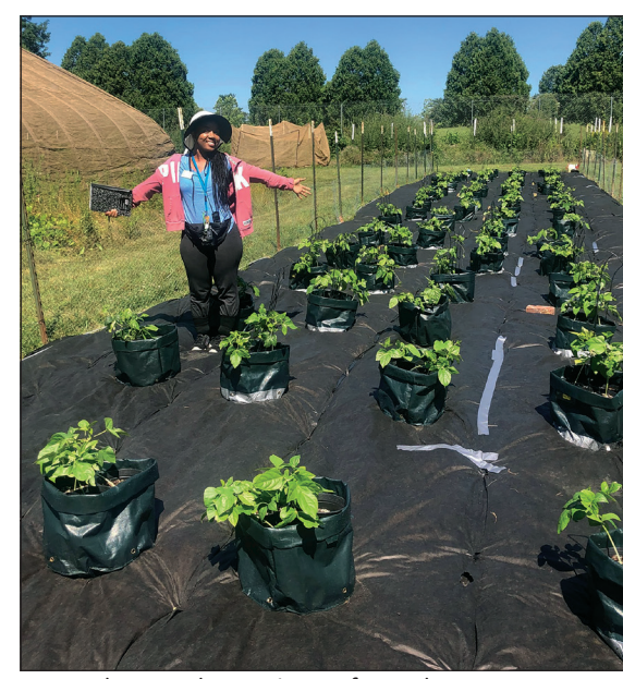
A proud Research Experiences for Undergraduates student with her project.