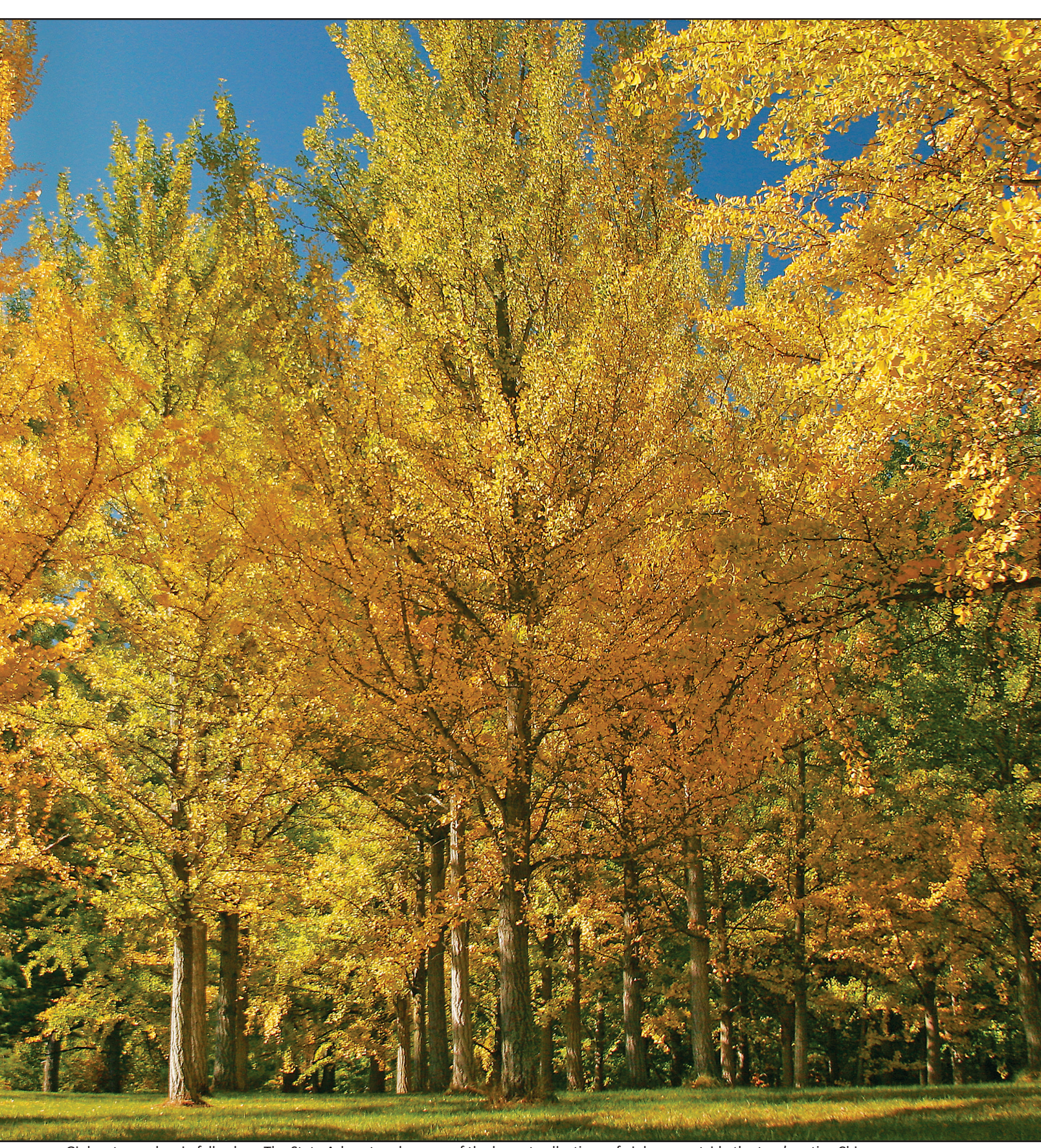
Ginkgo trees glow in fall colors. The State Arboretum has one of the largest collections of ginkgoes outside the tree's native China.