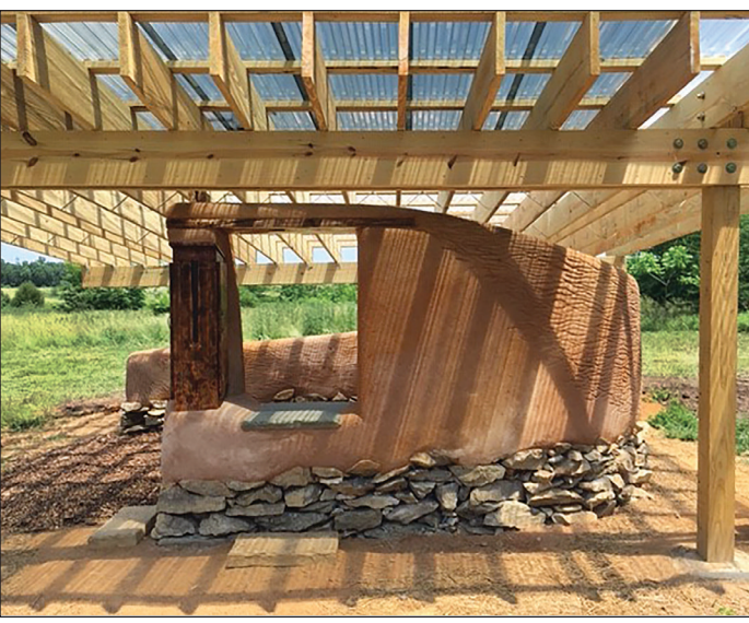
A functional art installation titled Dwelling: Shenandoah Valley was created as a home for native bees.