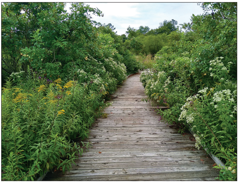
The Nancy Larrick Crosby native plant trail winds through three different habitats.